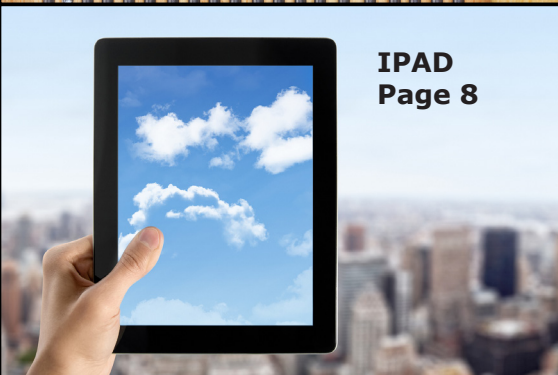
IPAD Page 8