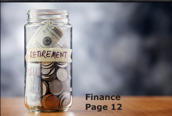
Finance Page 12

Non-profit Organization U.S. Postage PAID Sioux Falls, SD Permit #7752