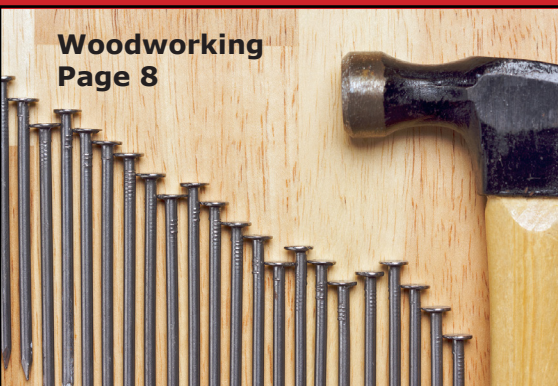
Woodworking Page 8