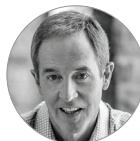
ANDY STANLEY Leadership Author and Communicator