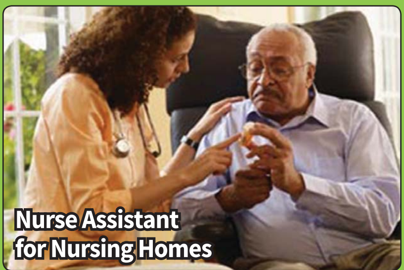
Nurse Assistant for Nursing Homes