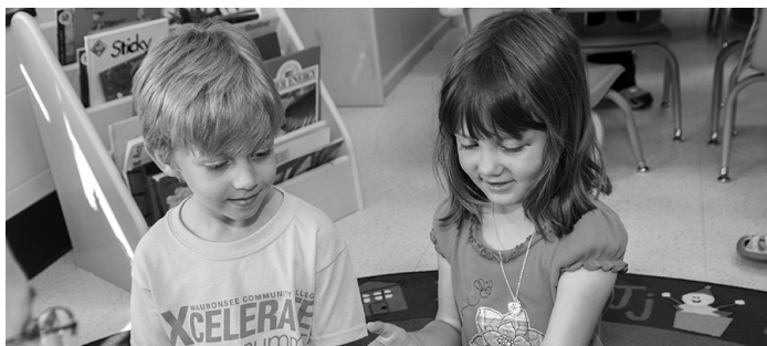
Just for preschoolers

Welcome aboard matey! Sail the seven seas in search of adventure, experiment with materials that float, learn the art of knot tying, design your own spyglass, and learn to read a map to find hidden treasure. X marks the spot! Grab your eye patch and compass and become part of this crew! CLASS FEE: $69