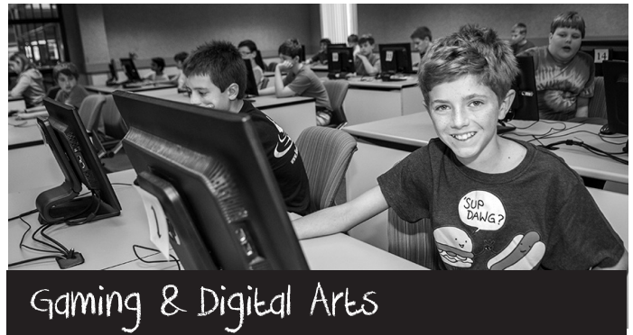
Gaming & Digital Arts

153INT725.001 (30830) 9:00am- 12:00pm MTWThF HCC103 Moss Meets between: Aug. 3-Aug. 7