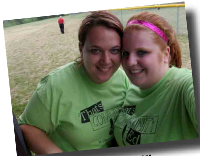
Super fun Staff!

South JH-Cafe, door 5 1 ses $12 5103 W Jun 13 6:30-8:30 pm