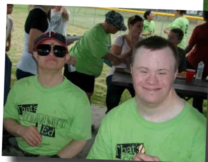
It's a hit