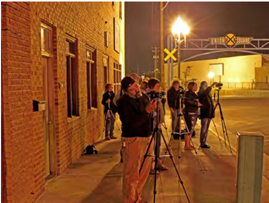
Outdoor Digital Photography