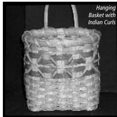
Hanging Basket with Indian Curls