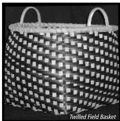
Twilled Field Basket