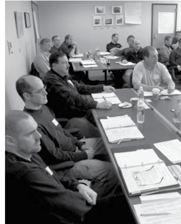
Irving Tissue employees attend a leadership training seminar.

Local businesses may also be eligible to participate in our NYS Community College Workforce Development Training Grant Program. Letters of interest are due June 30 of each year. Please contact us for more information regarding eligibility requirements.