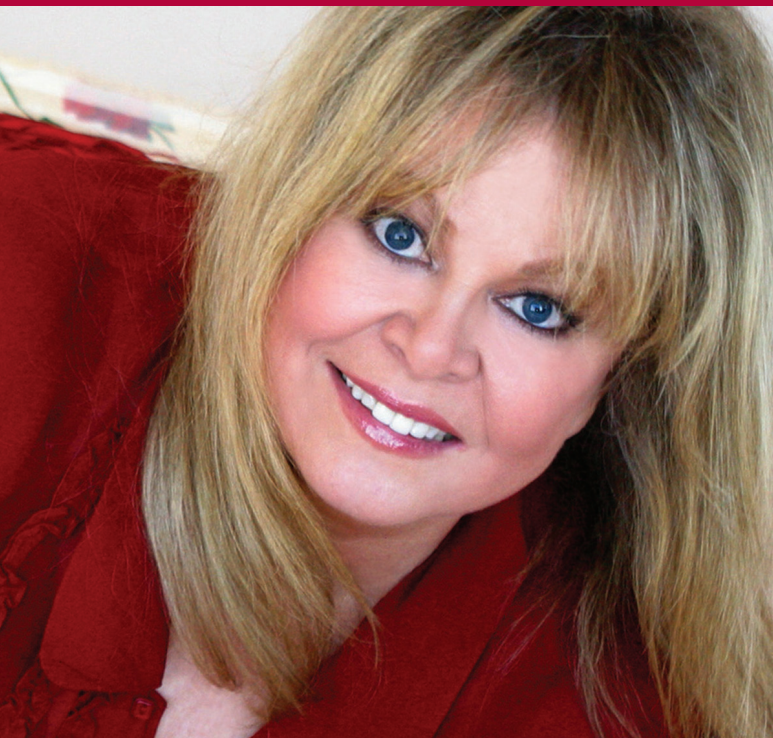
SALLY STRUTHERS Emmy-Award Winning TV Star PAGE 4

FIREHOUSE ARTS CENTER PRESENTS JULY - AUGUST 2012