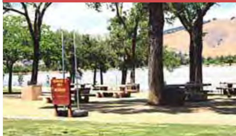
CENTRAL PARK PICNIC RESERVATIONS