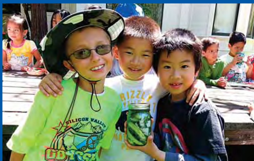
School Break Camps . . . . . pages 4-13