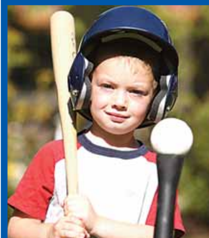
Tot Sports . . . . page 45