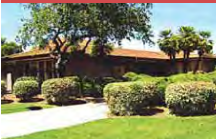
LOS CERRITOS COMMUNITY CENTER