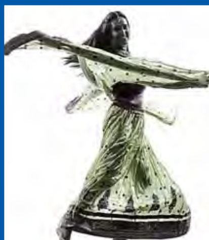
Dance . . . . pages 22-24