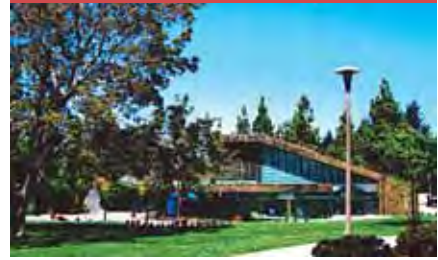
WARM SPRINGS COMMUNITY CENTER