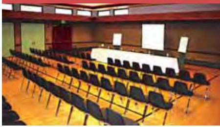
CENTERVILLE COMMUNITY CENTER