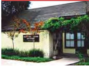
OLIVE HYDE ART CENTER