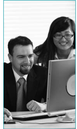
18–20 Computer Training