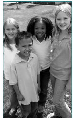
28 Kids, Tweens & Teens