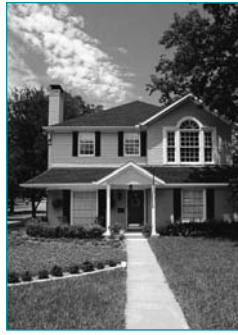
3–11 Career Training

Gloucester County College is accredited by the Middle States Commission on Higher Education, 3624 Market Street, Philadelphia, PA 19104 (267-284-5000). The Middle States Commission on Higher Education is an institutional accrediting agency recognized by the U.S. Secretary of Education and the Council for Higher Education Accreditation.