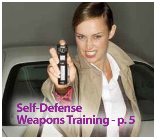
Self-Defense Weapons Training - p. 5