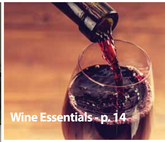
Wine Essentials - p. 14