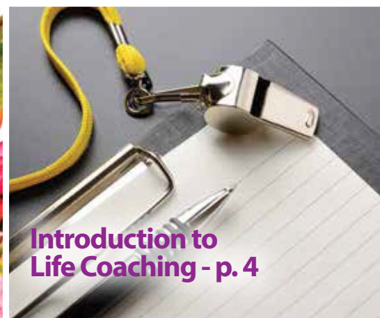
Introduction to Life Coaching - p. 4