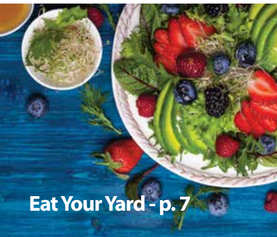
Eat Your Yard - p. 7