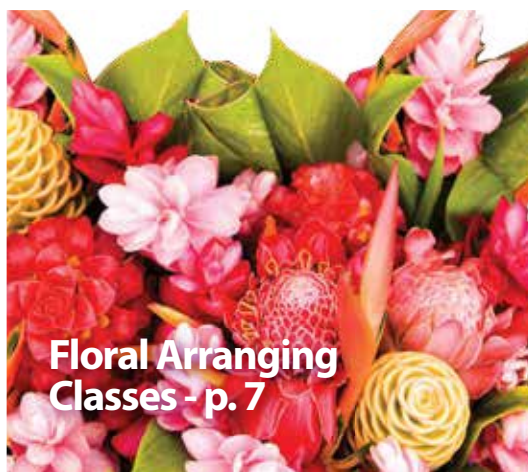
Floral Arranging Classes - p. 7