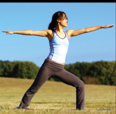
PERSONAL ENRICHMENT page 29