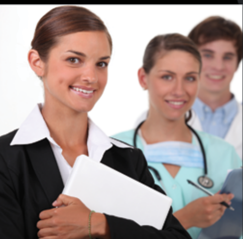
CAREER & WORKFORCE TRAINING page 4