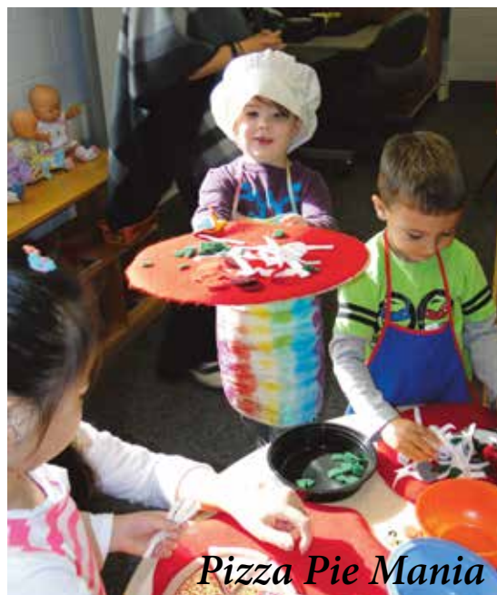
Pizza Pie Mania

1520.113 Tu/Th 11/1-12/15 9:30-11 AM Northrop-Rm 210 12 Sessions $185 No Class 11/22 and 11/24