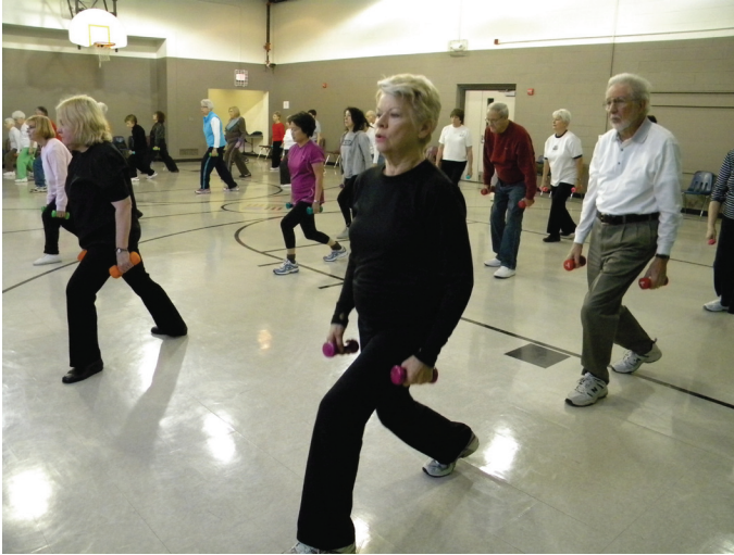
Stretch and Tone is low impact exercise for seniors that meets on Tuesday and Thursday mornings.