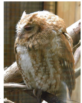
Nature Nook's red Eastern Screech Owl.

Join our naturalist for a close-up look at owls, one of nature's most amazing birds and learn why they are so vocal on such cold winter nights. This program will begin in the Nature Nook so you can see an owl first hand and learn about all the adaptations that help them own the night. We will then drive over to the West Bloomfield Woods and Nature Preserve to hike on the trail and attempt to call in live owls for a closer look. This program is designed for groups no larger than 16, so pick the date that works best for you and register early.