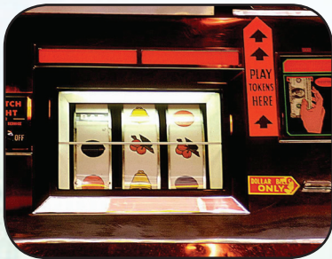
Let's Go Up North! Annual Kewadin Trip