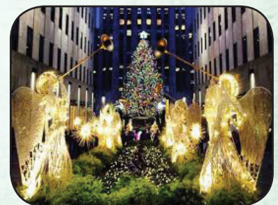
New York Holiday