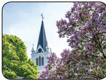
Mackinac Island LILAC FESTIVAL