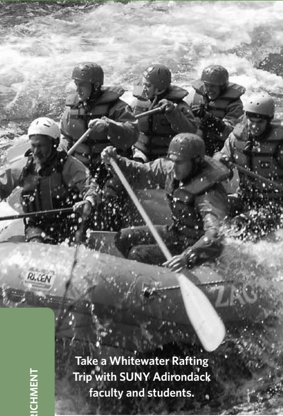
Take a Whitewater Rafting Trip with SUNY Adirondack faculty and students.

SUNY Adirondack Continuing Education offers community members the opportunity to experience college courses alongside credit students in our adventure sports, music and international education programs. Be a part of these fun and educational experiences and join us for a course this spring semester!