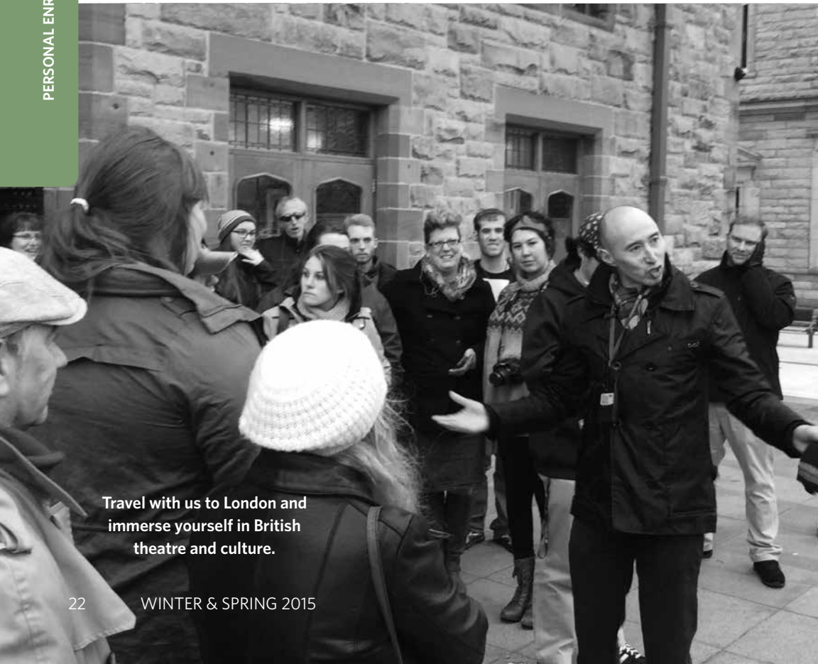
Travel with us to London and immerse yourself in British theatre and culture.