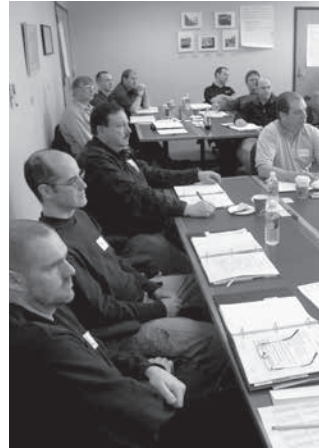
Irving Tissue employees attend a leadership training seminar.

Local businesses may also be eligible to participate in our NYS Community College Workforce Development Training Grant Program. Letters of interest are due June 30 of each year. Please contact us for more information regarding eligibility requirements.