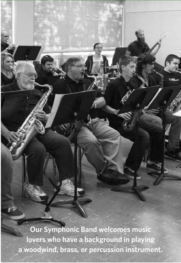
Our Symphonic Band welcomes music lovers who have a background in playing a woodwind, brass, or percussion instrument.