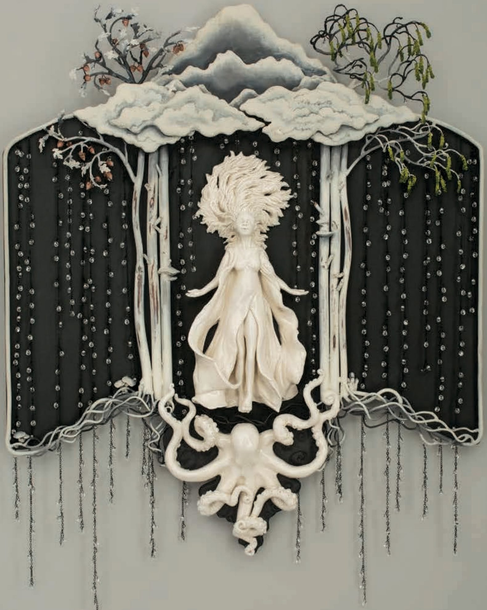
Aquapia - Loralin Toney