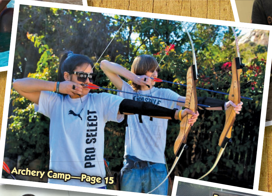
Archery Camp—Page 15