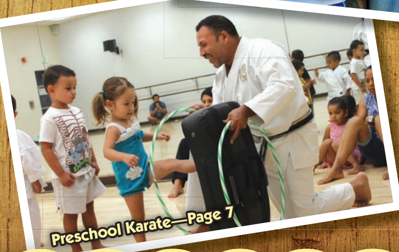
Preschool Karate—Page 7