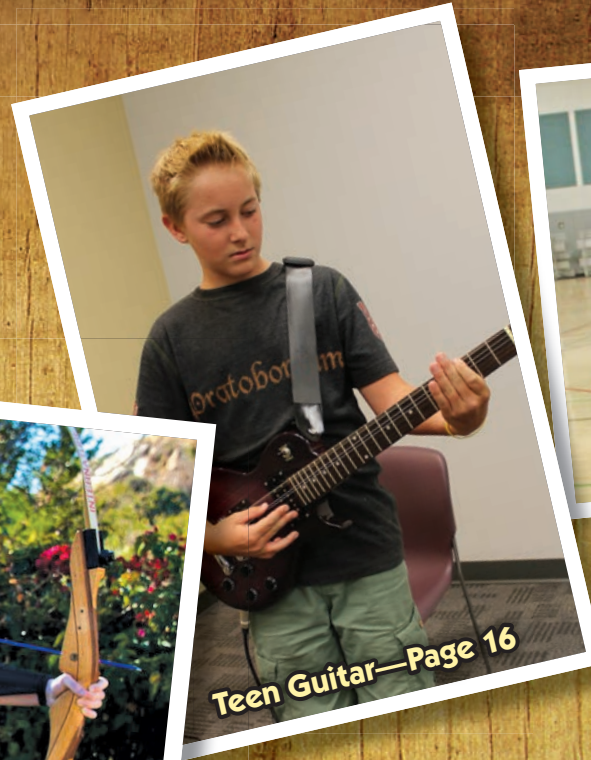
Teen Guitar—Page 16