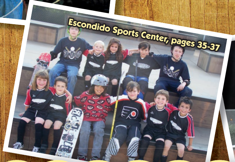
Escondido Sports Center, pages 35-37

Community Services Department City of Escondido 201 North Broadway Escondido, CA 92025-2790