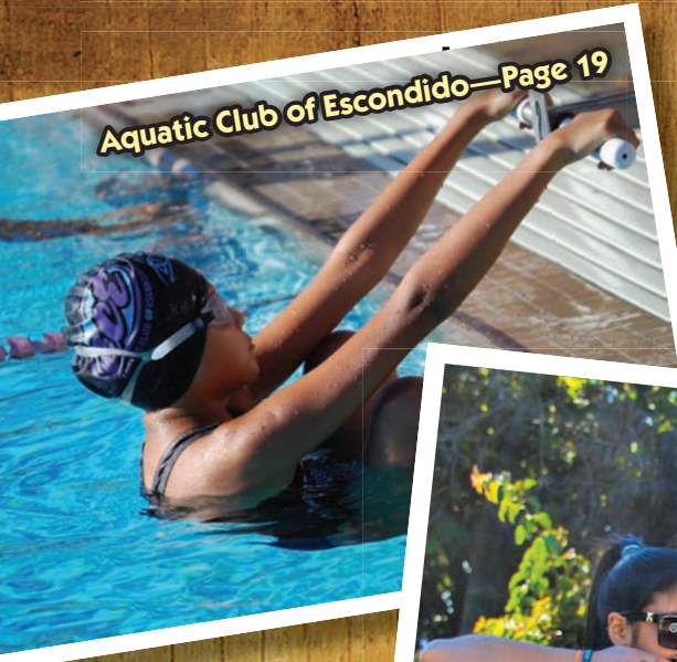
Aquatic Club of Escondido—Page 19

For more information call 760.839.4691 or visit recreation.escondido.org