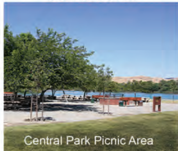
Central Park Picnic Area