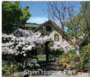
Shinn Historic Park