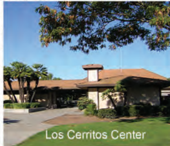
Los Cerritos Center