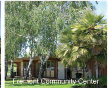
Fremont Community Center