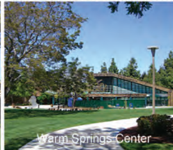
Warm Springs Center