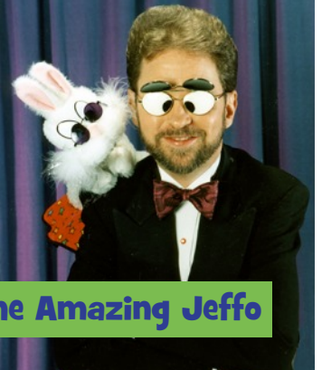
The Amazing Jeppo