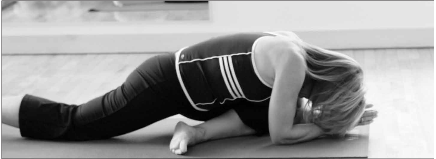
The "Resting Pigeon" is a relaxing yoga pose.