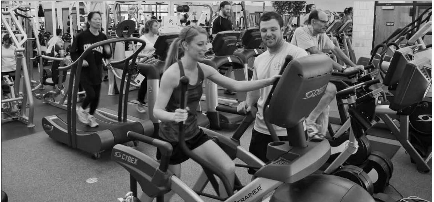
All three recreation centers have new treadmills, arc-trainers, step mills, rowing machines and spin bikes. Come check it out!