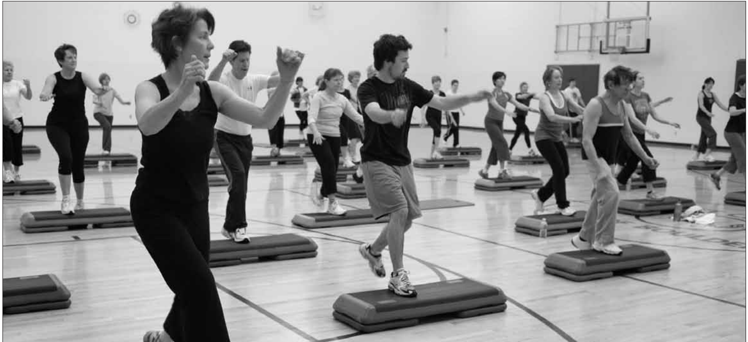
Motivation is what got you started, habit is what keeps you going!