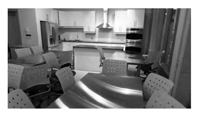
Our cooking and food courses are held in our brand new, state of the art, fully-equipped kitchen.