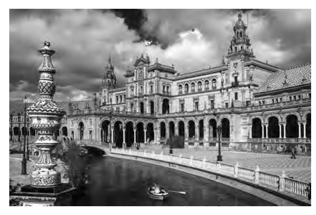
Image courtesy of Scott Annandale. Scott will be teaching Architectural Photography in the Spring 2014 term.