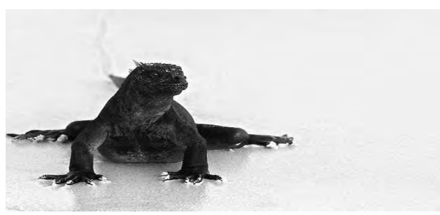
Matt will be teaching Nature Photography in the Spring 2014 term.