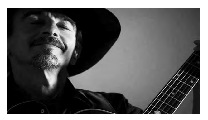
Image courtesy of Anthony Maddalena. Portraiture will be offered in the Spring 2014 term.