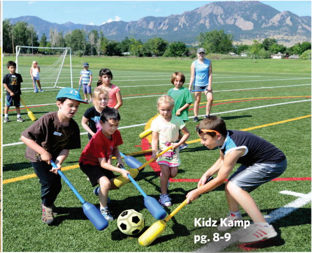
Kidz Kamp pg. 8-9

Play. Splash. Make new friends. Have fun. Smile - a lot. That's what we envision your child's summer to be like when they participate in a Boulder Parks and Recreation camp this summer. We pair talented, enthusiastic staff with the right park or recreation facility to create the ideal formula for summertime fun. Each program is designed to develop specific skills while stimulating your child's physical, intellectual and social growth. We achieve this by balancing caring and compassion with challenge and adventure. The result is a near-perfect environment for bonding, learning, laughter and fun. Make this summer special for your child-enroll them in their favorite Parks and Rec summer camps today! Register online at www.BoulderParks-Rec.org or call 303-413-7270.