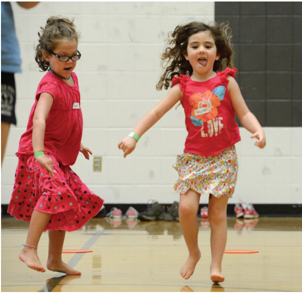
We design into each summer camp the ideal balance between personal enrichment and all-out fun!