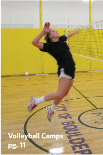
Volleyball Camps pg. 11