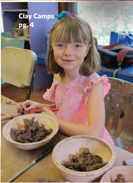
Clay Camps pg. 4