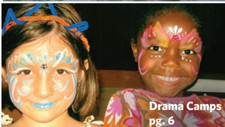
Drama Camps pg. 6