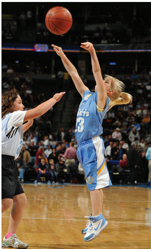
Learn from the best and improve your shooting skills with a Denver Nuggets Clinic!