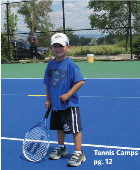
Tennis Camps pg. 12