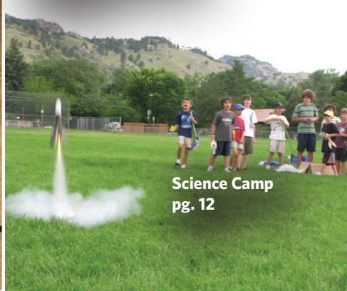
Science Camp pg. 12