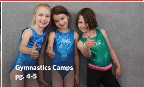
Gymnastics Camps pg. 4-5