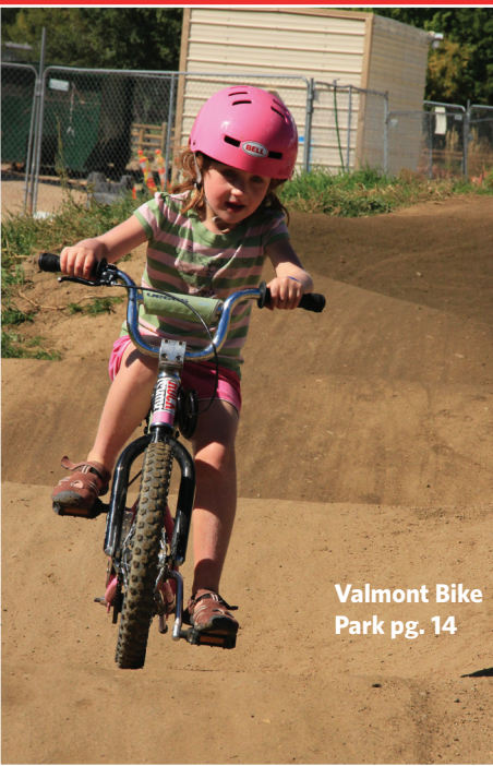
Valmont Bike Park pg. 14