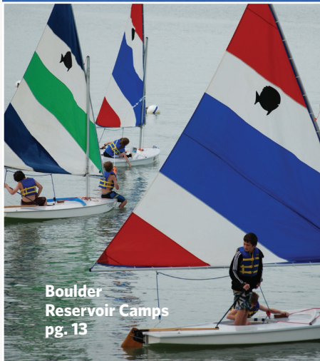
Boulder Reservoir Camps pg. 13

Play. Splash. Make new friends. Have fun. Smile - a lot. That's what we envision your child's summer to be like when they participate in a Boulder Parks and Recreation camp this summer. We pair talented, enthusiastic staff with the right park or recreation facility to create the ideal formula for summertime fun. Each program is designed to develop specific skills while stimulating your child's physical, intellectual and social growth. We achieve this by balancing caring and compassion with challenge and adventure. The result is a near-perfect environment for bonding, learning, laughter and fun. Make this summer special for your child-enroll them in their favorite Parks and Rec summer camps today! Register online at www.BoulderParks-Rec.org or call 303-413-7270.